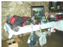
Awesome raffle prizes at the 2001 Annual Meeting Banquet