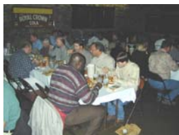
Chowing down at the 2001 Annual Meeting Banquet