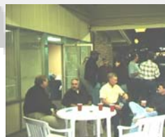
Enjoying a drink on the veranda at the 1999 Annual Meeting