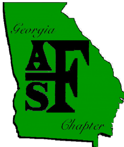
Figure 3. Logo adopted by GA-AFS in 1994.